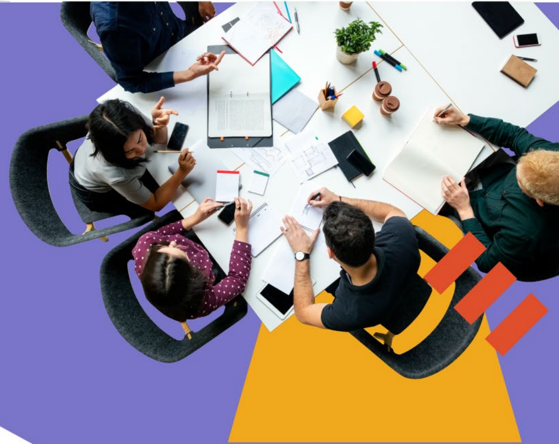
Ulrike Storost European Commission