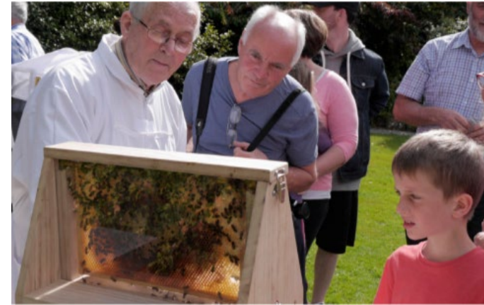
Heritage at School